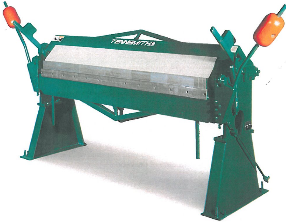
Model HBT72-16 Shown